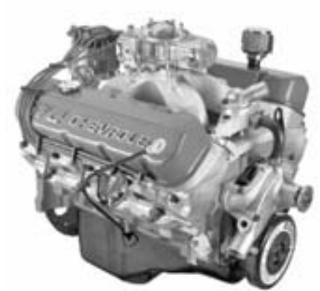
This hot rod crate engine will be the prize.

intake manifold port matched to oval port heads, and high lift hydraulic roller camshaft, may leave some people scratching their heads over just what to do with it. But to a hot rodder or car collector, such as those who come to the annual Car Show, this engine is a dream, said Ed Reavie of Nostalgia Productions.