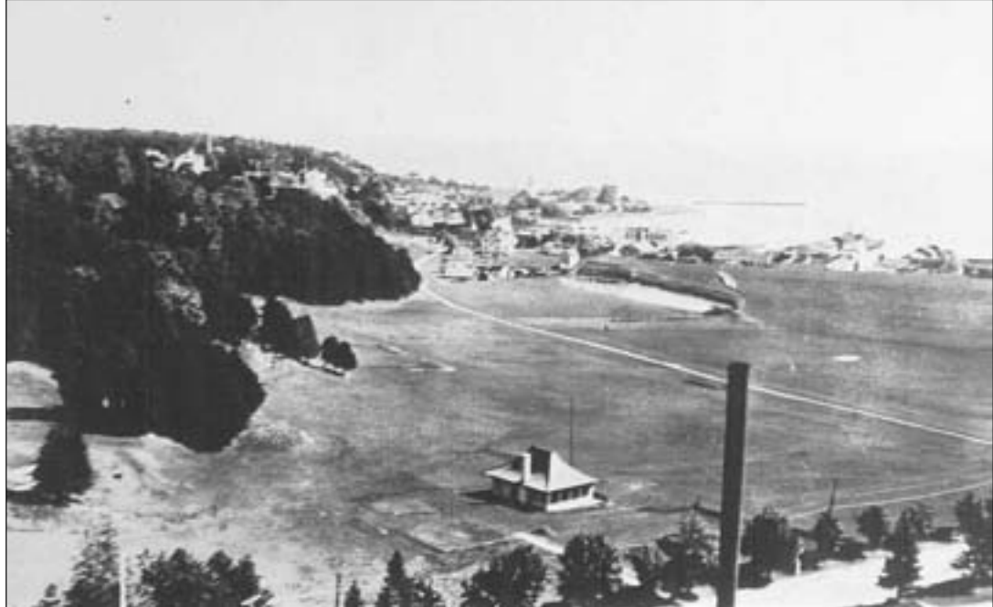
A view of the Grand Hotel golf course sometime between 1910 and 1934. The lone building is the course Snack Bar, which now is the Jockey Club at the Grand Stand. Golfers had to watch for pedestrians and carriages crossing on Spring Street, which crossed the No. 9 fairway and led to Turkey Hill. The Snack Bar offered snacks until after World War I, when it began serving sandwiches, then became an after-dinner piano bar. Today, it serves a full menu.