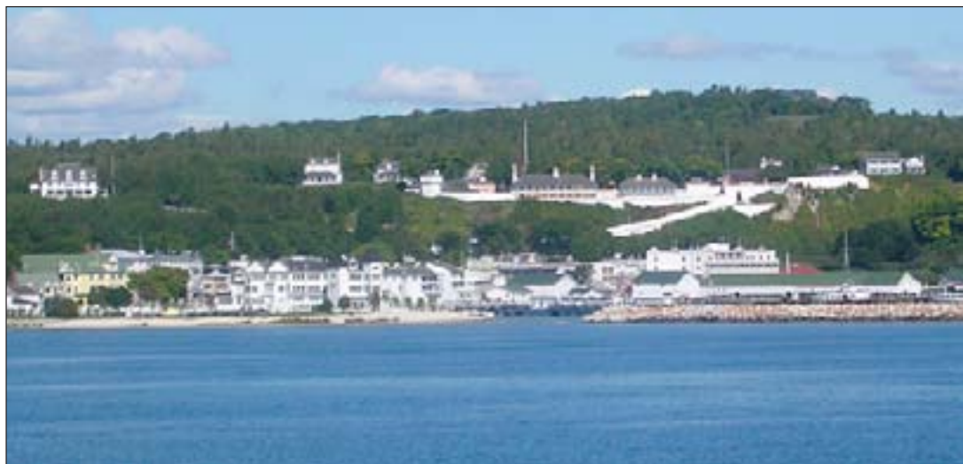
Fort Mackinac, as seen from Round Island, is part of the Mackinac State Historic Parks and overlooks the downtown area of Mackinac Island. To the far left of the fort is the Governor's summer residence.