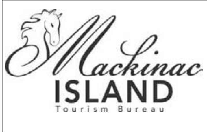
Mackinac Island Tourism Bureau's new logo.