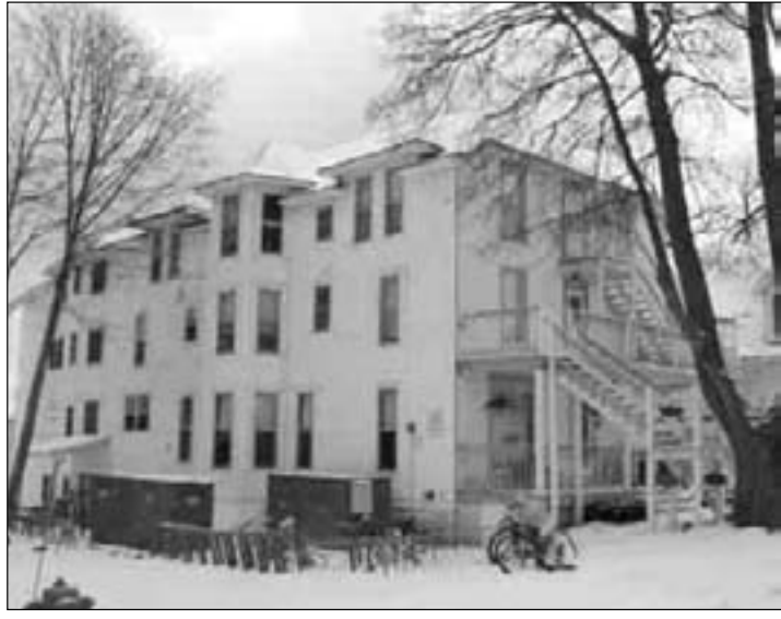
Maple View housing will remain a dormitory for employees, the Mackinac Island Planning Commission decided.

The three commissioners who favored the conversion did so because it would reduce housing density and create a safer structure. Housing density has been discussed as the city revises its Master Plan.