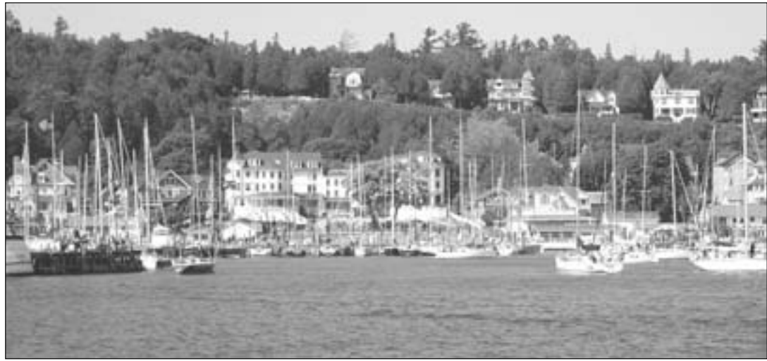
Mackinac Island East Bluff cottages stand watch over sailboats that filled the Island marina during the Chicago to Mackinac Yacht Race in mid-July.

Marinas in the Eastern Upper Peninsula and northern