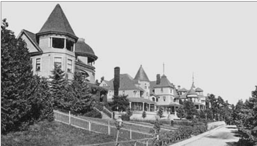
A turn-of-the-century postcard view of West Bluff cottages on Mackinac Island.

Mr. Caskey, who would soon earn fame as the builder of Grand Hotel, favored a vernacular Carpenter Gothic style for the summer residences. This building genre took full advantage of Michigan's white pine trees being cut by Mr. Stockbridge and other lumbermen.